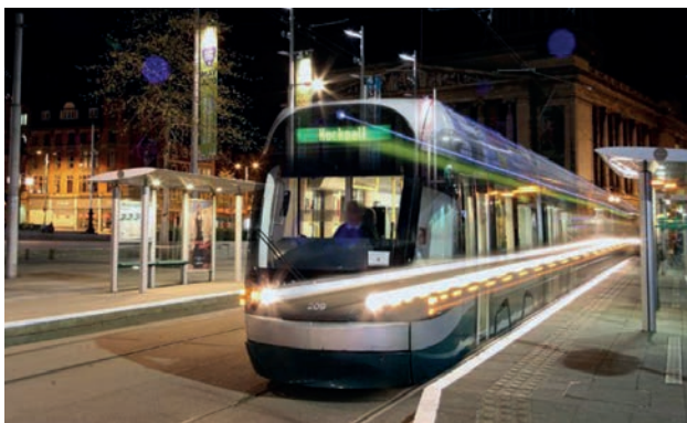
Nottingham Express Transit has 14.5 km of Factory Pre-Coated Rail

Email: appliedtechnologies@trelleborg.com