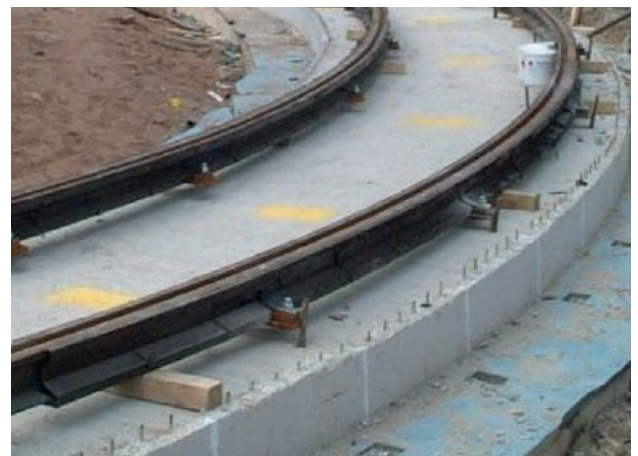
Pre-Coated Rail Track Under Construction

Pre-Coated Rail offers a high level of stray current protection combined with low track stiffness to reduce adverse environmental impacts and to deliver better long term performance than other resilient solutions such as pour-in-situ polymer.