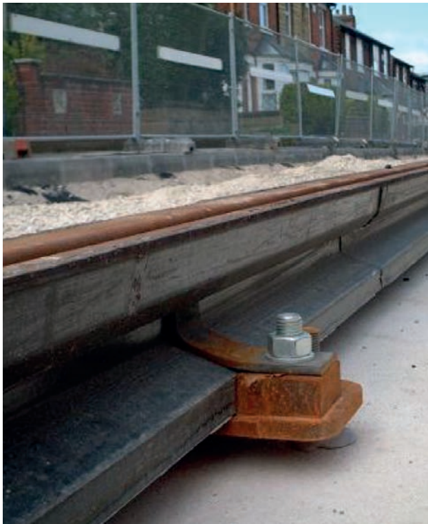
Installation of Pre-Coated Rail

These advantages, combined with simplified construction and past performance enabled Trelleborg's Pre-Coated Rail to become a leading rail encapsulation solution system in the UK and Ireland.