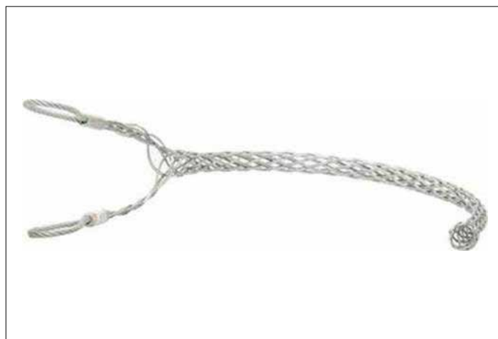
Wire cable stocking: "Secure hose sleeve"