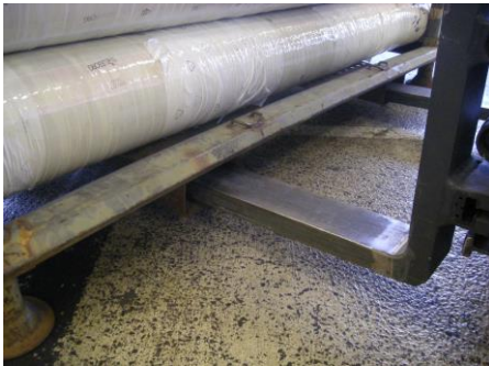
Use specific location for forks

The use of a forklift is generally recommended.