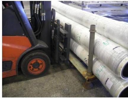
Engage forks thoroughly