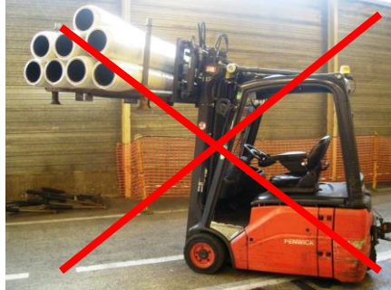
Do not raise too high when useless