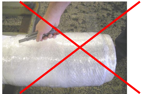
Do not cut it with a cutter that may cut the rubber cover

Never use staple on the protective film or directly on the hose body to fix a temporary marking.