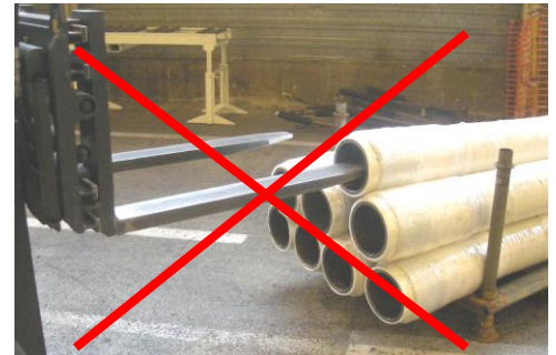
Do not raise hoses through ID

Do not drag the hose across abrasive surfaces or sharp parts.