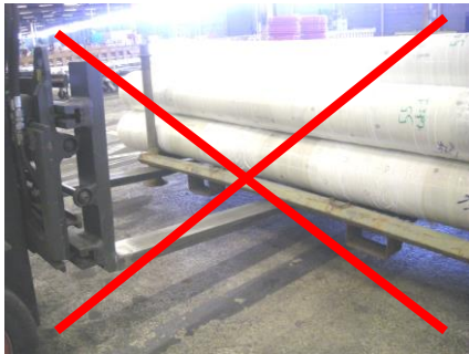
Do not unbalance the load