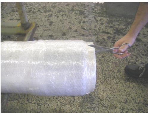
Remove the protective film (if any) with a pair of scissor.

Hoses must keep their original packing for preservation as long as possible till the final use or the hose couplings assembly.