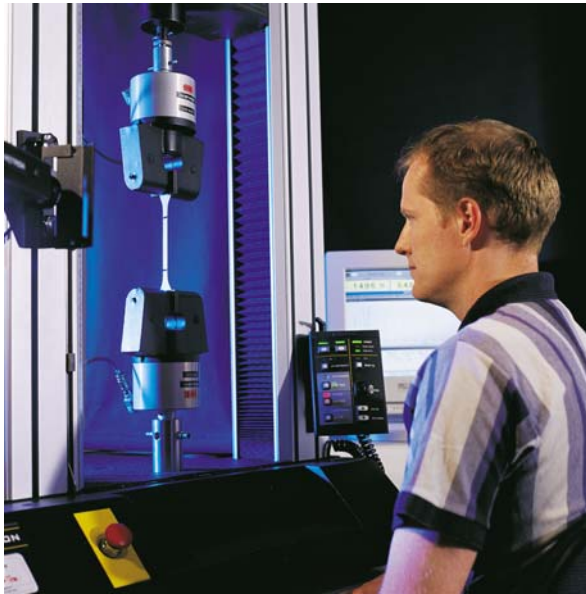
Figure 3. Tensile tester used for determination of maximum elongation and tensile strength

are sealed. The ability to be stretched is indicated by the elongation-at-break, the maximum extension of an elastomer at the time of rupture. This is expressed as percentage of the original length. The ability to be compressed is indicated by the hardness of the material.