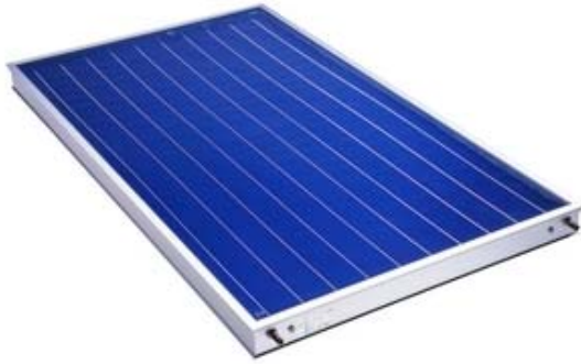
Figure 1. Glazed flat plate collector.